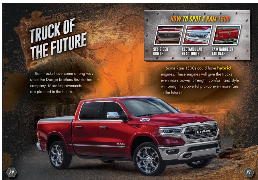
Sample spread from Ram 1500